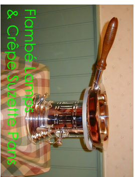
Flambé Lamps & Crêpe Suzette Pans