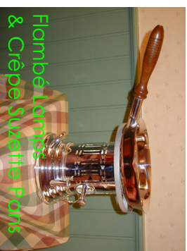
Flambé Lamps & Crêpe Suzette Pans